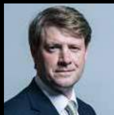
Chris Skidmore OBE MP & Chair of Net Zero Review